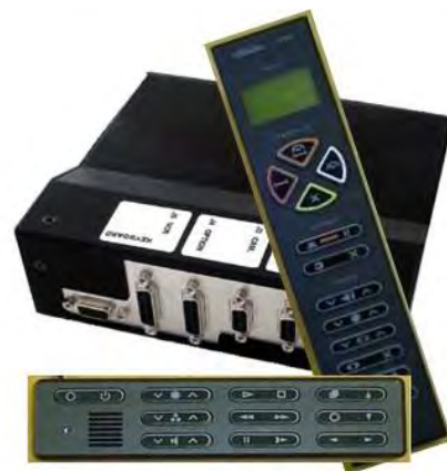
ProVida 2000 components