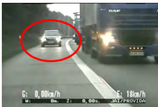
Hard shoulder violation