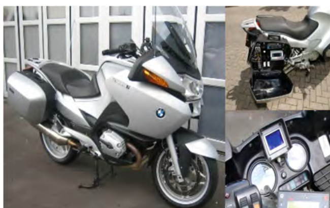
ProVida 2000 Bike

ProVida is also available as a motorbike version, with specifically designed switches and 3.5" LCD monitor suitable for handlebar mounting.