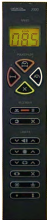
ProVida 2000 RCU

The front-facing Kestrel camera has a 10x optical zoom lens and a built-in switchable microphone to allow in-car audio recordings to be made.