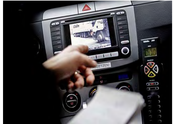
ProVida 2000 monitor display

The video can be displayed on an existing in car monitor, combined with an in-car ANPR display or on a stand alone monitor. Video can be stored on the optional ProVida HDR or any other recording device.