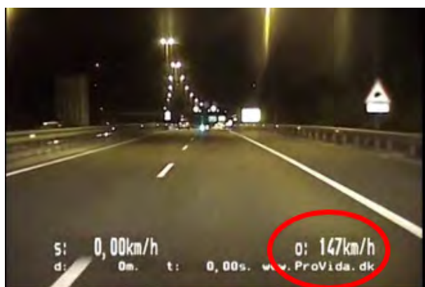
High speed pursuit

Recorded files are in a proprietary XBA file format to ensure sensitive evidence can only be viewed by authorised personnel and can be easily copied as a standard AVI file for burning to a disc.